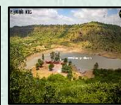
Dargoba Mandir Pare