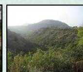
Sagareshwar Wildlife Sanctuary