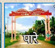
Dargoba Mandir Pare